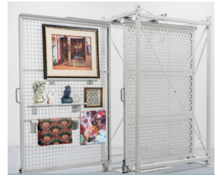
SCREENS FULLY EXTEND