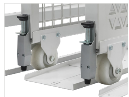
BUILT-IN FOOT BRAKE